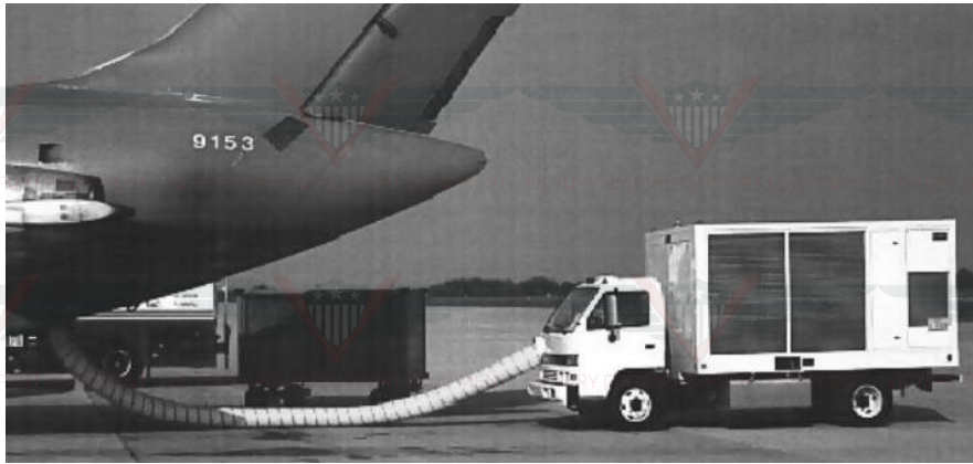
Model 5080DE Truck Mounted